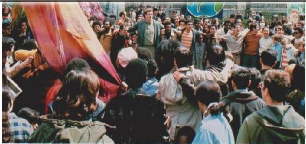
NEW YORK CITY, APRIL 22, 1970: JASON LAURE, WOODFIN CAMP & ASSOCIATES